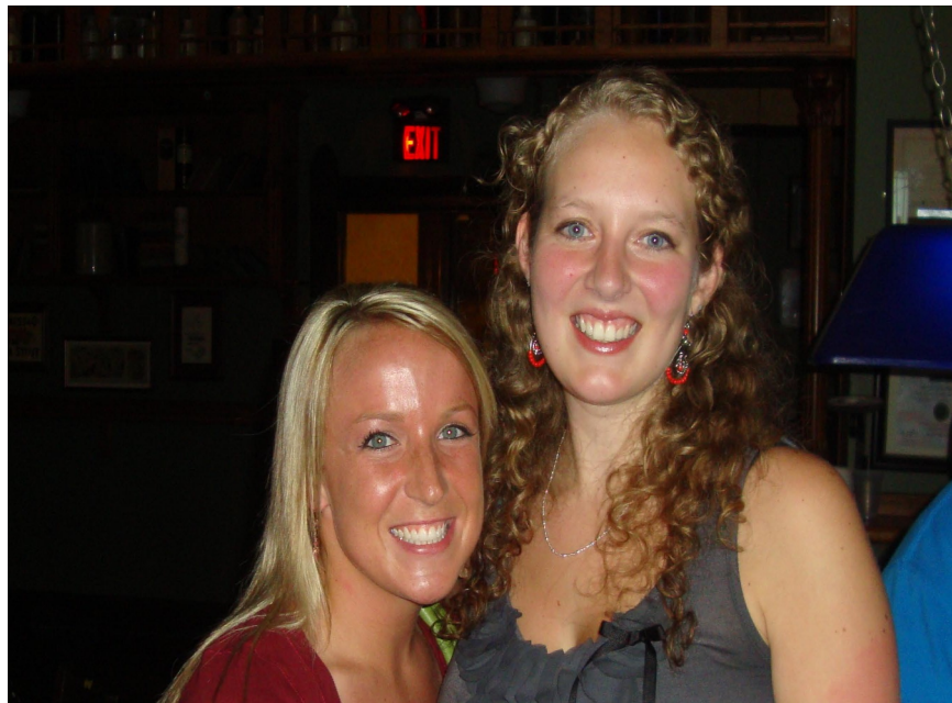
Enjoying the 2006 Five-Year Reunion

The reunion season this past year was filled with several amazing events so we've added some pictures for you to enjoy on subsequent pages. The Classes of 1991, 2001, and 2006 all had social events that were fun and entertaining. As this newsletter is written, the class of '82 has a 30th reunion scheduled for Oct. 6 at the Lookout Heights Civic Club. The Class of 1987 has a 25th reunion planned for Brookwood Swim Club on July 21 plus a Cincinnati Reds baseball game. The Class of 1992 will host its 20 year reunion at the Fort Wright Civic Club on Oct 6. The Class of 1997 has all the details set for their reunion weekend with multiple events. The main event will be on Aug. 11 at Leaping Lizard. Molly Malone's will host the 2002 reunion on Aug. 18. The Class of 2006 has already enjoyed an informal reunion on Aug. 12 also at Molly Malone's. The Class of 2007 enjoyed their reunion at Legends on May 19. For additional information on any of these reunions see http://www.scotthighschoolalumni.org/ .