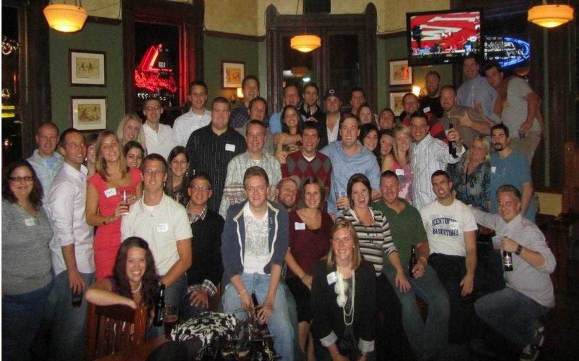
A great time was had by all at Molly Malone's