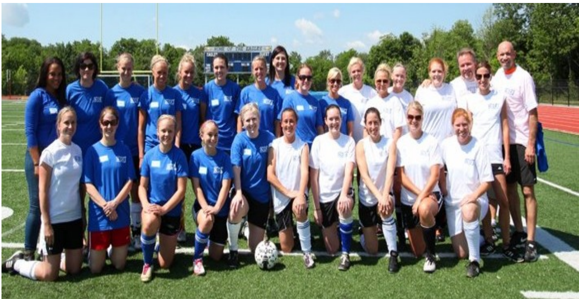
Scott Girls Alumni Soccer Players at the alumni match.